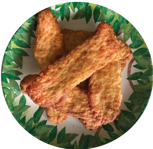
You may have tasted these at the Winter Social – they were a great hit!