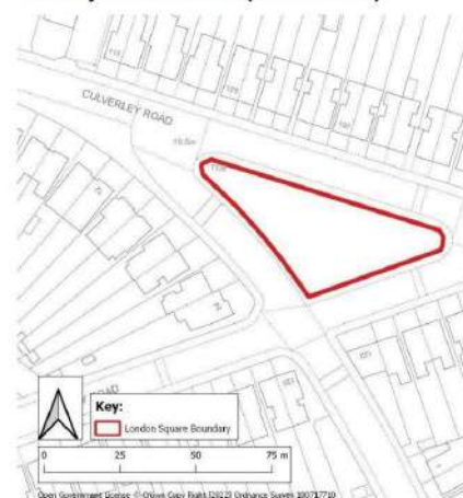
Culverley Green London Square - boundary:

Overall, we feel this is an appropriate level of protection in the determination of planning applications both within and surrounding Culverley Green.