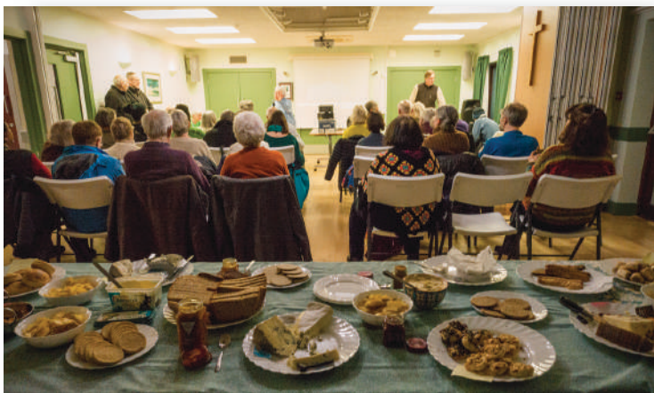
At the Winter Social