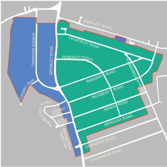
The extent of the Conservation area: the area currently covered by the residents association is in green; the additional area in blue.

At the AGM in April, we will ask members to agree to extend the area but we may have to call a special meeting if we need to amend our constitution.