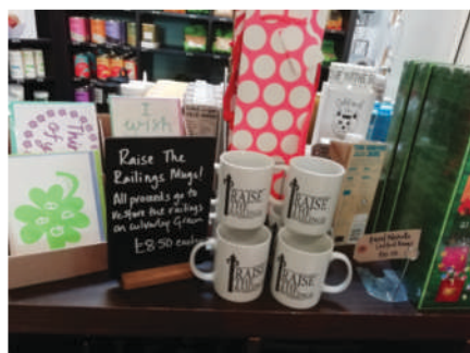
'Raise the Railings' mugs on sale at Good Food

Our first forays into grant applications (Veolia and the National Lottery Heritage Fund) have not been successful so far but there are many other trusts and foundations for us to try.