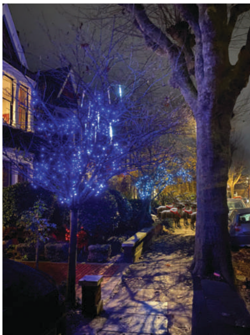
lit up front gardens