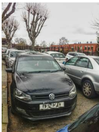
Double parking on Penerley Road outside Rushey Green School

Despite the Council's efforts, fly-tipping continues so it is important that any new tipping is reported.