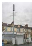
A similar mast in Torridon Road

In none of the applications that have been submitted has there been a justification of why a mast is needed in an area that already has good reception, and one must be suspicious that this may be a box-ticking exercise (it being cheaper to erect a mast here than in say