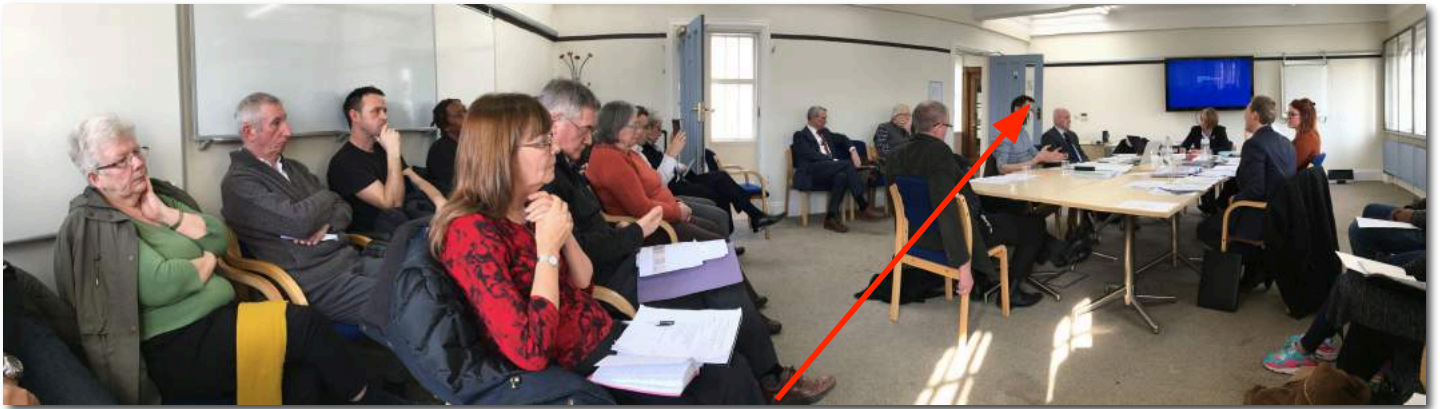
The all-day planning enquiry starts to take its toll. The architect (arrowed) asked that he should not be identifiable.

The appeal by the developer over the Council's rejection of their application to build 29 units -- the so-called 'Slab' -- on the site of Phoebe's Garden Centre was held on 14th February. Seven of the developer's men came to defend their scheme, against a team of three from the Council. Fortunately, around 20 local residents were there and gave their views frankly. In fairness, the Inspector, appointed by central government, allowed everyone to have their say, and it was followed by a site